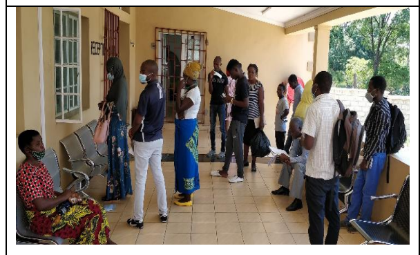
Blantyre- People queuing up for renewal of ID cards